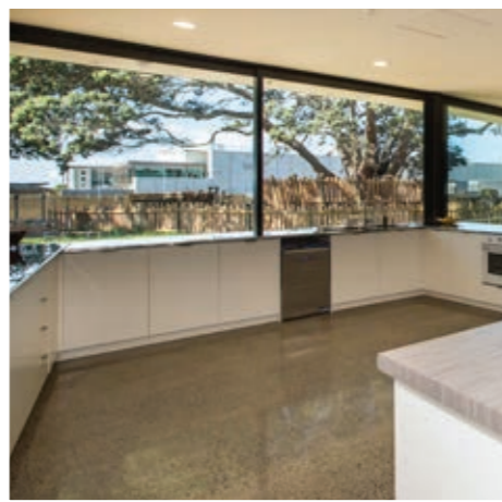
ABOVE LEFT Eurostackers easily provide a 6m opening. ABOVE RIGHT Large bench to ceiling windows seamlessly frame the outdoor view. RIGHT A connection between the indoors and outdoors is key to the success of this open learning environment.