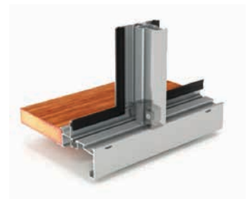
Patented mullion connection system