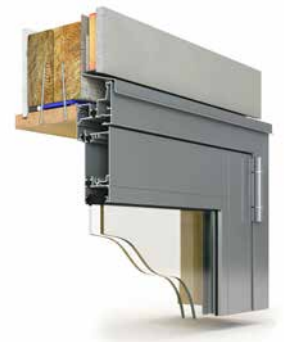
Hinge Door Head